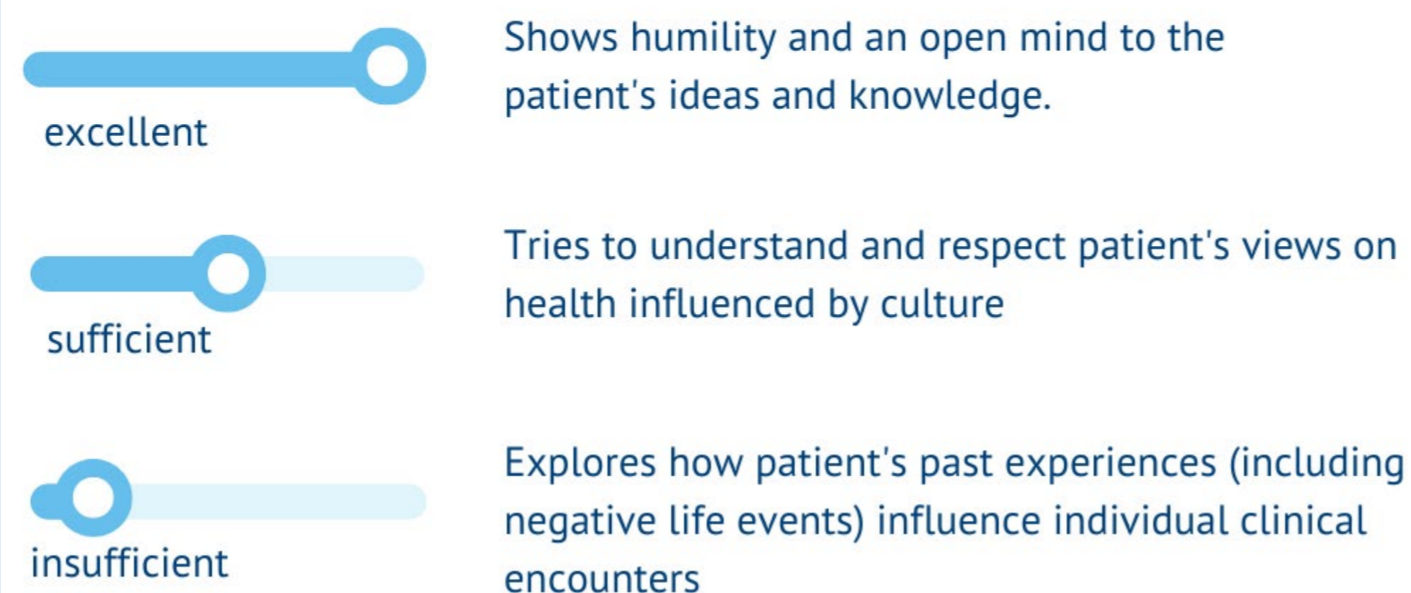
Fig. 1 Example of competency-based instrument

The GP trainee creates an inclusive and cultural safe practice environment.